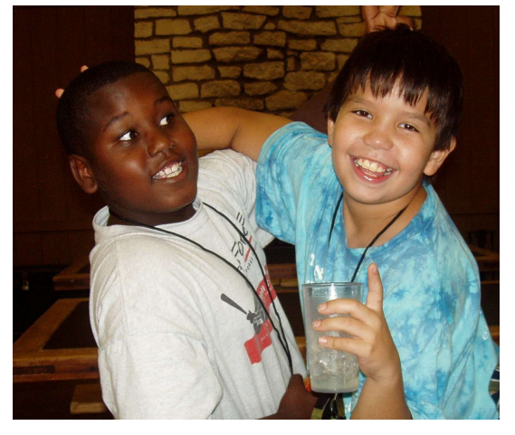
A chance to make new friends!