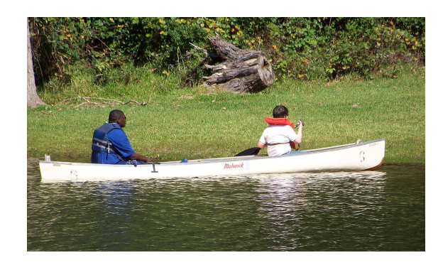
Challenge Frustrating Fun And sometimes wet!