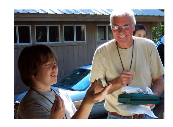
Challenged To be more than you are. To try new things. Teamwork.