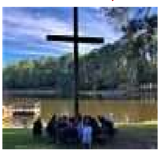
Camp Allen Campsite 3 Episcopal Diocese of Texas 18800 FM 362 Navasota, TX 77868