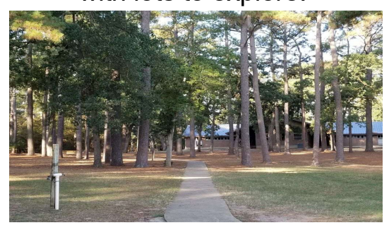
To those who live in an urban area, there are wonderful things to discover.

The campsite is a wooded area with lots to explore.