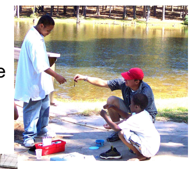
You have to have the right bait.

Sometimes you get lucky and catch a fish.